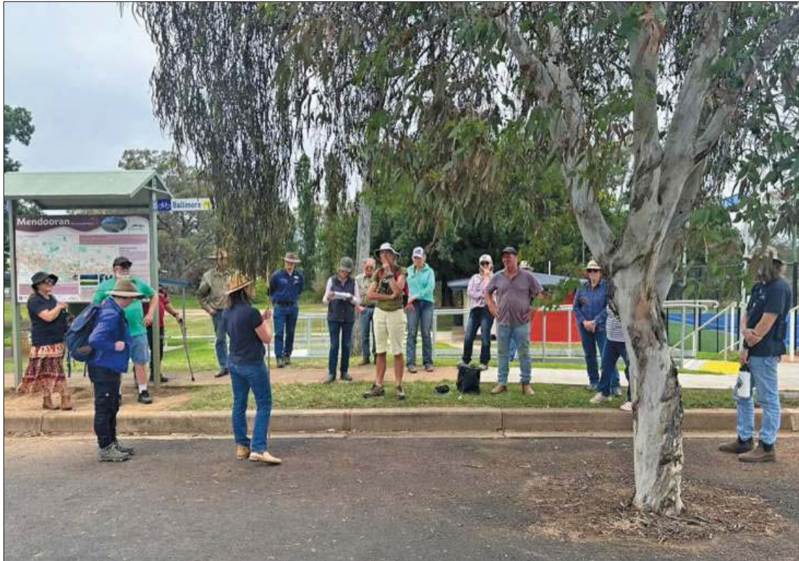
Attendees at the Three Rivers Landcare Birdlife Australia Mistletoe Roadshow gained hands-on information on the importance of mistletoe to the environment.